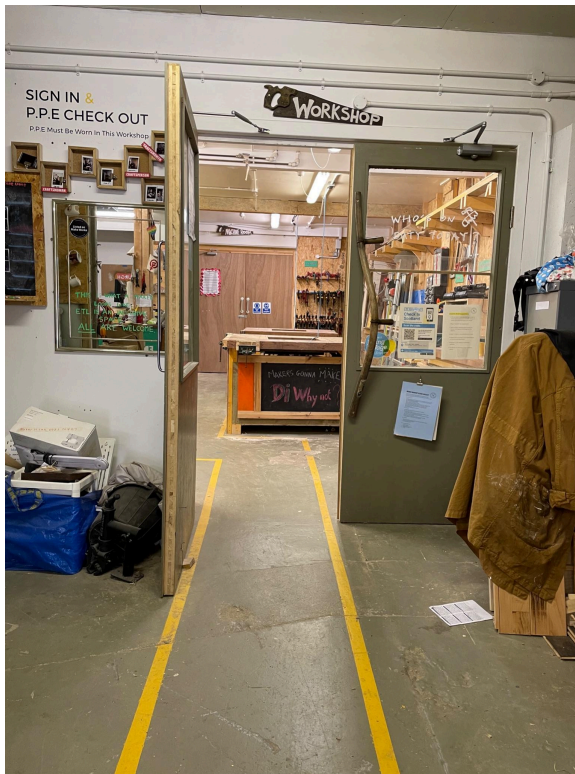
Photo 6: inside the reception and library area leading to the workshop